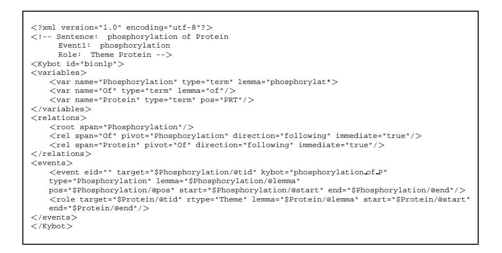
Figure 2: Example of a Kybot for the pattern Event of Protein.