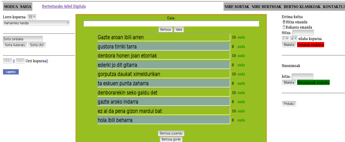
Figure 1: A verse written in the BAD web application.